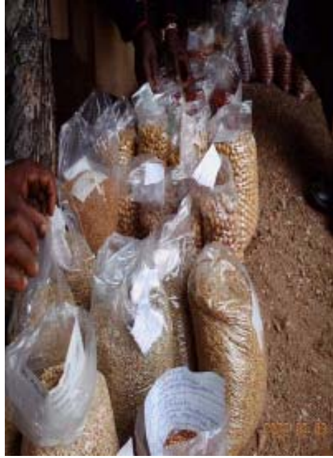
Figure 1: Village exhibitions at a Seed Fair in Gwanda District, Zimbabwe. The seed can be displayed in transparent plastic bags for easy viewing.