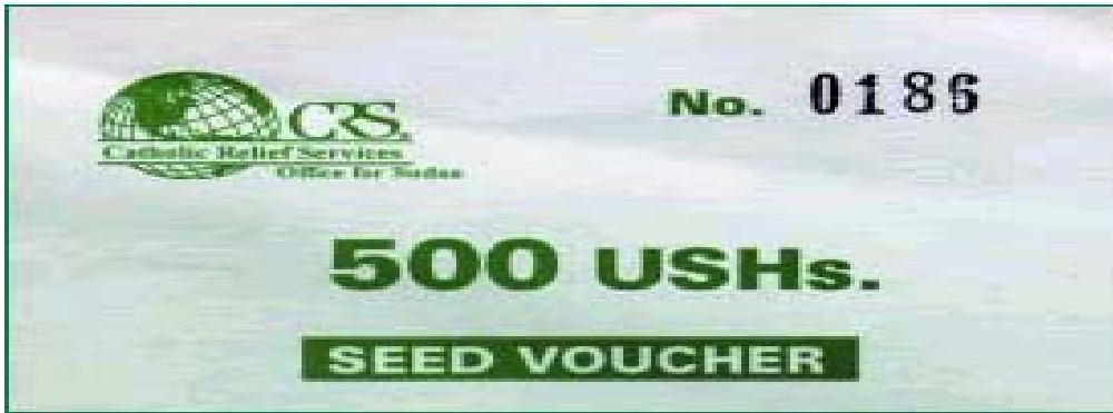
Figure 1: A seed voucher valued 500 Ugandan Shillings used by the Catholic Relief Services in Uganda.