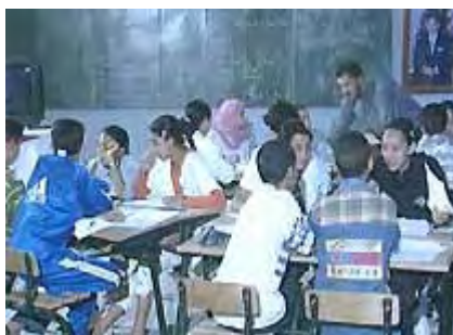
EHL pilot phase, Morocco