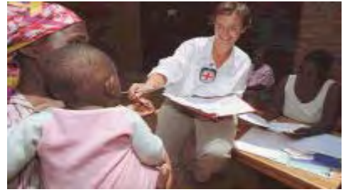
ICRC/Rwanda (Ref. : n° 00183)

Detained minors must be protected by particular measures. Apart from very young children who accompany their mother held in detention, minors must be separated from adults, receive special care and be dealt with by an adequate judicial system. When visiting detainees, the ICRC carefully checks whether the rights of minors are being respected by the authorities.