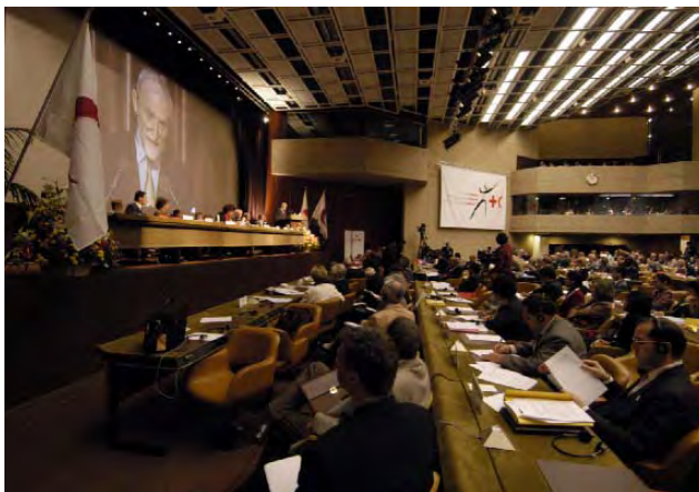
Opening of the first plenary session of the 28th International Conference of the Red Cross and Red Crescent (3 December 2003)

Action 11. States will seek to improve the plight of children living in difficult circumstances by meeting their special needs, with emphasis on prevention of sexual exploitation and physical and other forms of abuse and the sale of children with the ultimate objective of the reintegration of these children into their families and society. States will strive to achieve the rapid conclusion of the work of the United Nations Working Group on an Optional Protocol to the Convention on the Rights of the Child, on the Sale of Children, Child Prostitution and Child Pornography.