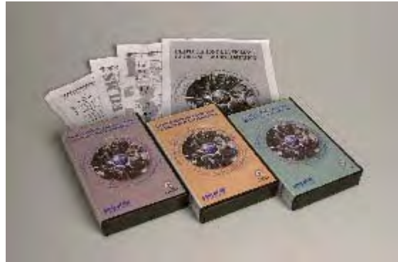
Teaching module "Exploitation of Violence"